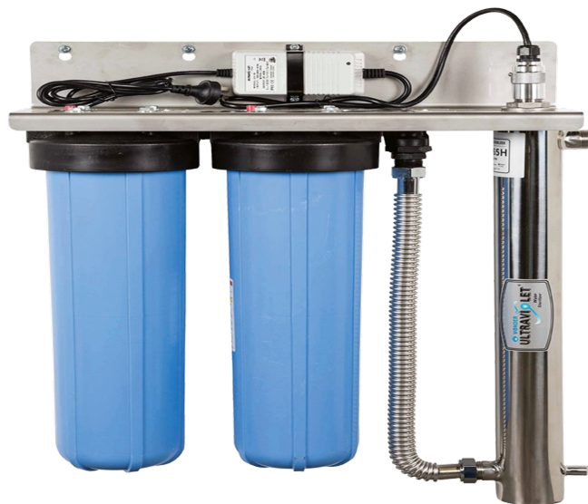
Model Shown: UVSP-165Z-304-SWB