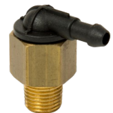
Optional Addition: Temperature Management Valve