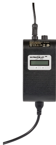
Optional Digital Ballast Models: UVABUVT6 UVABUVT8

The SP Series range is perfect for whole house applications on all types of water supplies giving you peace of mind and bacteria free drinking water.