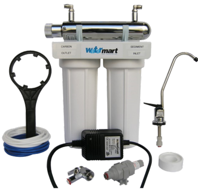
W2SUFUV: 2 Stage under sink UV system 1gpm

The HR60 is perfectly suited for low flow single tap or under sink drinking water systems on all types of water supplies.