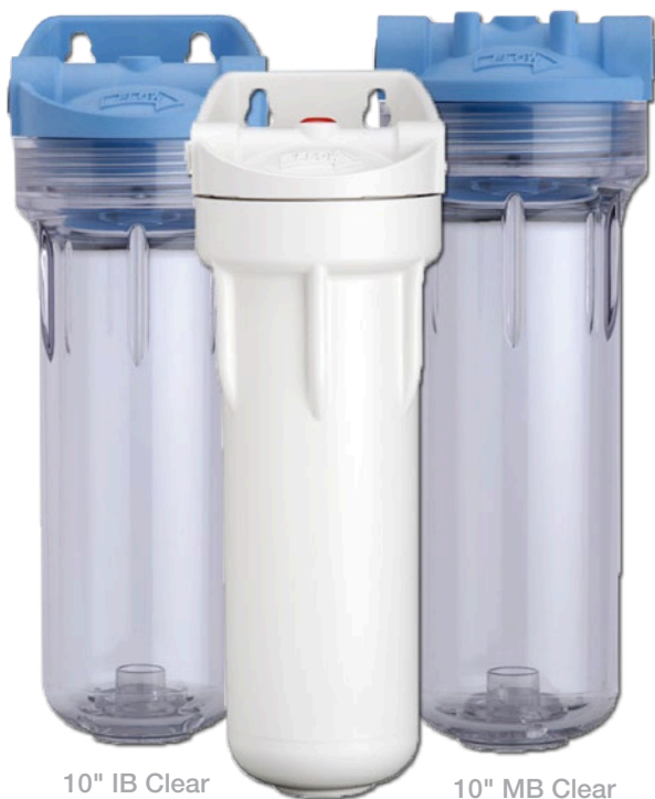
10" IB Clear