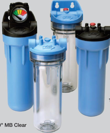
10" IB Clear